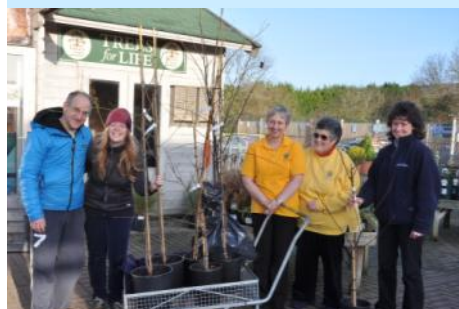
The sign in the background reads 'Trees for Life' - rather appropriate

Various types of trees have been planted