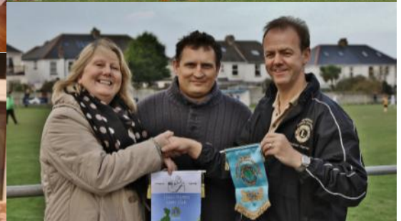
Top: Godolphin Athletic & Torpoint Athletic Middle: Action from both teams Bottom: Clubs exchange Bannerettes