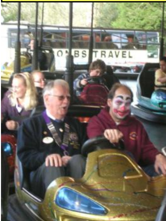
HOLSWORTHY FUN DAY

District Governors' teams share the work of growth and nurturing with the worldwide Global Membership Team and Global Leadership Team . The Club Excellence Process provides additional nurturing for Lions clubs around the world.