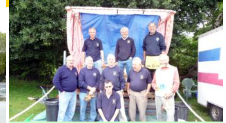
Plymouth Lions at Colebrook