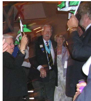
Warm Welcome from Devon Delegates at Belfast