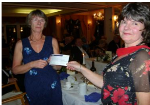
Presentation by Sidmouth Lions Club