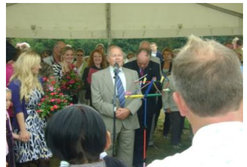
Turf Cutting Ceremony for Little Harbour at St Austell