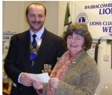
Presentation by Babbacombe & St Marychurch Lions Club